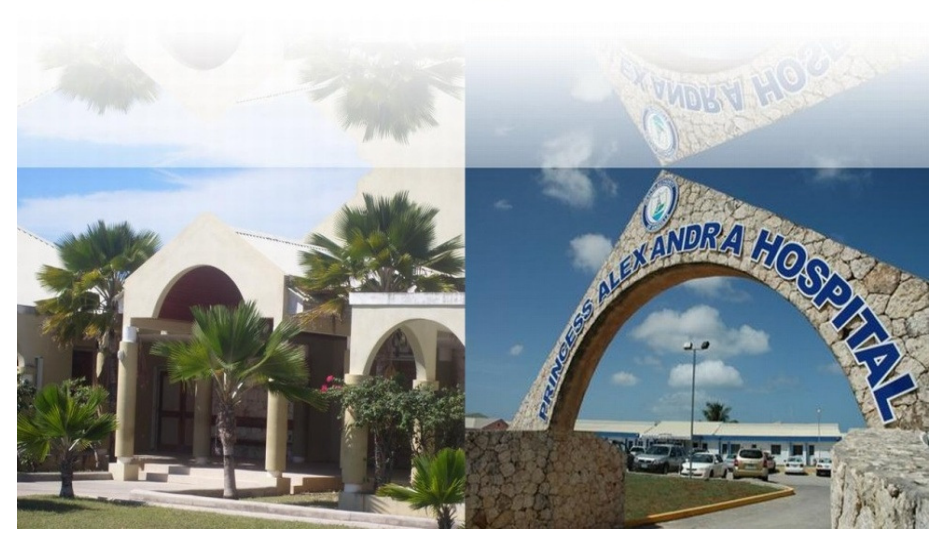
A Policy Guideline